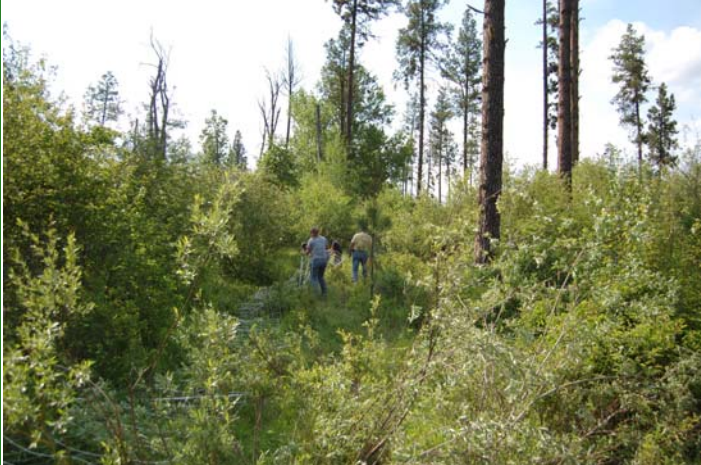
Setting up the fence