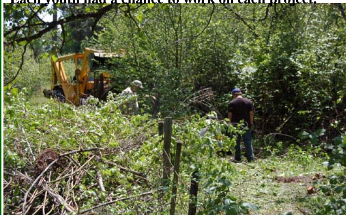
Clearing the back property line fence.