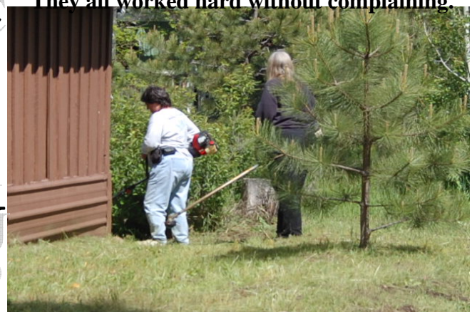
And the adults worked hard too!