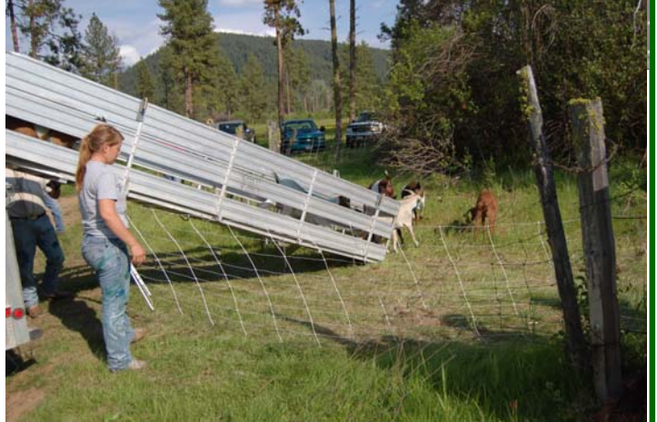
Heading into the brambles for lunch